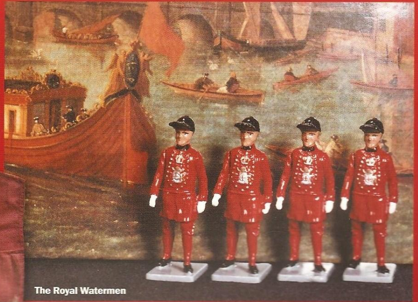
The Royal Watermen