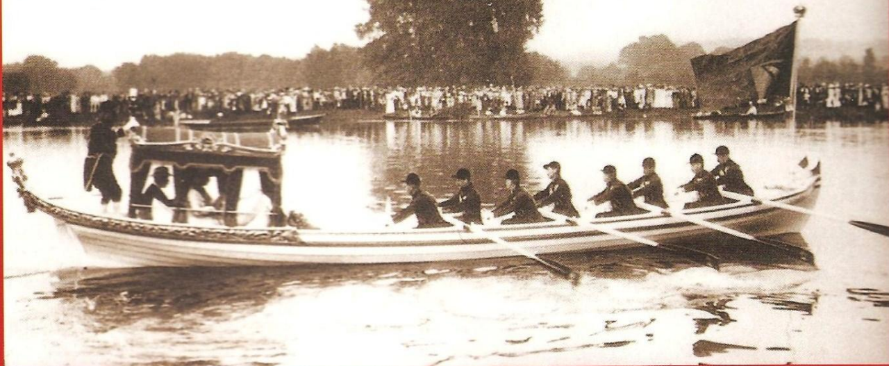
The Royal barge (or more correctly, shallop), used by King George V in 1912 at the Henley Regatta. Note the banner on the bow.

has a Royal Bargemaster who wears a scarlet tail-coat with white stockings. The Royal Watermen, of which there are 24, wear a scarlet skirted tunic, scarlet stockings and a dark blue cap. On the front and back of the tunic is a large, solid silver badge with the Royal cypher.