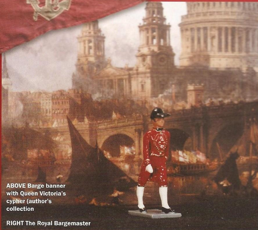
RIGHT The Royal Bargemaster

This illustrious contingent traces its ancestry to Henry VII (1487). Queen Elizabeth I made active use of her barge in travelling between her palaces in Greenwich, Whitehall, Richmond and Hampton Court.