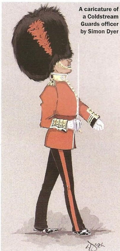
A caricature of a Coldstream Guards officer by Simon Dyer

'The uniform each Regiment wears is, by its very colour, royal. As far back as the reign of Canute, it is known that the 'House Carles', who