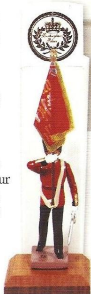
Colour Bearer, Grenadier Guards by Britains made for the Buckingham Palace gift shop.

Royal occasions when the Sovereign is personally present. The State Colours are larger than the battalion colours – five feet ten inches by four feet ten inches with a pike of ten feet five inches, compared to just three feet nine inches by three feet seven and a half inches.