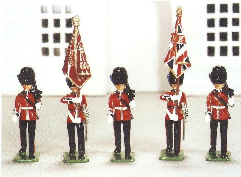
ABOVE Irish Guards Colour Party (00317). Note the arrangement of the Colours.

uniform now resides in the Guards Museum on Birdcage Walk in London.