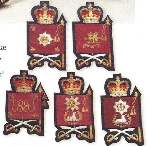
ABOVE Colour Sergeant arm badges. Bottom row, left to right: Grenadier, Scots, and Coldstream Guards. Top row: Irish and Welsh Guards.

feathered bonnet, dark blue doublet, and a kilt of Royal Stuart tartan. Pipers in the Irish Guards wear a green caubeen fashioned with a St. Patrick's blue hackle. Blue was chosen, rather than green, so as not to be confused with the Royal Irish Fusiliers, who wore a green plume on their bearskin. A dark green tunic with cloak is worn with a saffron colored kilt.