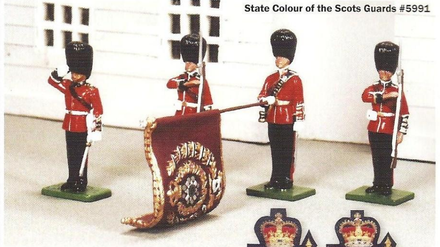
State Colour of the Scots Guards #5991