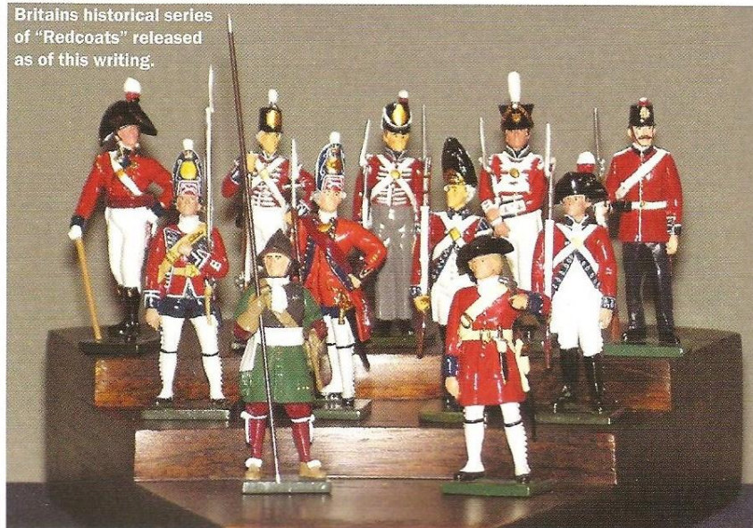
Britains historical series of "Redcoats" released as of this writing.

were his bodyguard, were clothed in scarlet. When the Normans brought to the Royal coat of arms a shield in which the ground of the top left quarter was also scarlet, the fashion was set. Not until the reign of Charles II were blue facings, and in some cases, blue tunics, associated with the Royal Household.'