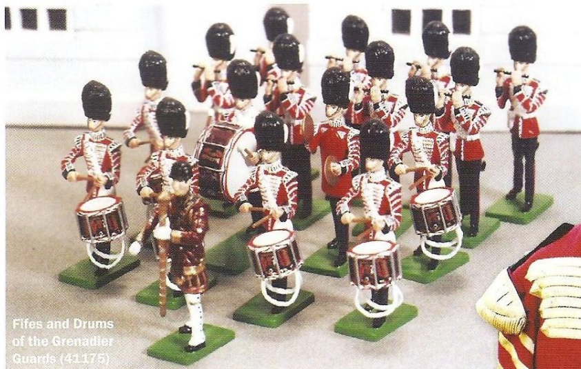
Fifes and Drums of the Grenadier Guards (41175)

The Scots Guards trace their lineage to 1642 (Argyll's Regiment). In 1686, they were brought into the English Army's establishment. Queen Victoria designated them the 'Scots Guards' in 1877, and they took precedence with the Foot Guards as the Third Regiment.