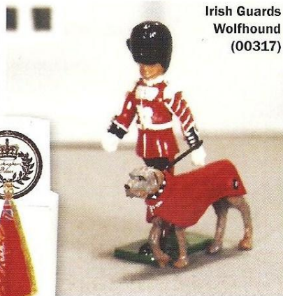
Irish Guards Wolfhound (00317)

The Grenadier, Coldstream and Scots guards also have special State Colours. These are used only for